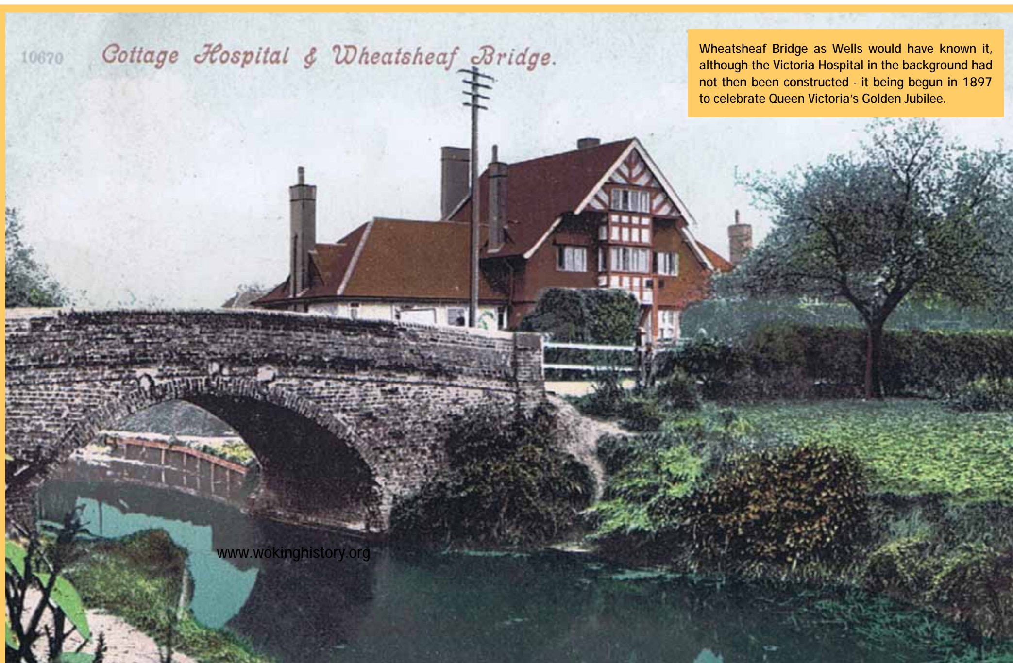
Wheatsheaf Bridge as Wells would have known it, although the Victoria Hospital in the background had not then been constructed - it being begun in 1897 to celebrate Queen Victoria's Golden Jubilee.

In the story Ogilvy and Henderson return to the