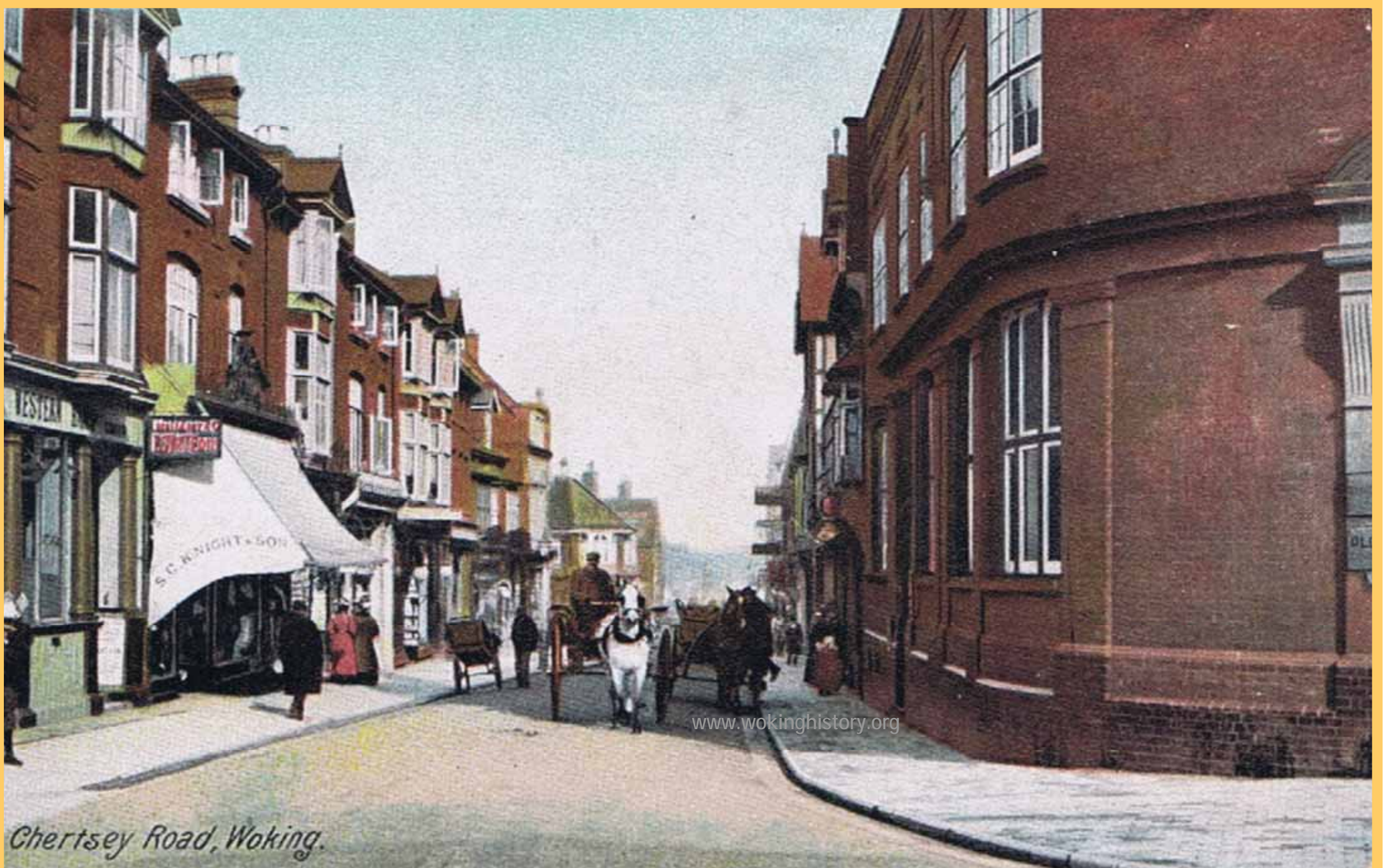
Chertsey Road, Woking.