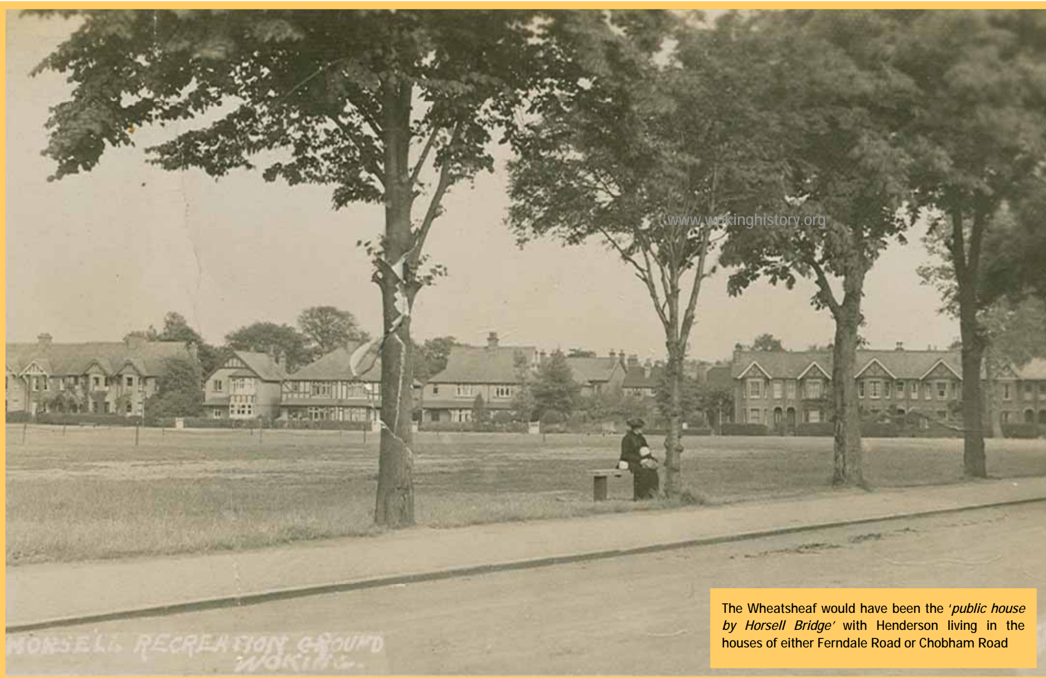
The Wheatsheaf would have been the ' public house by Horsell Bridge ' with Henderson living in the houses of either Ferndale Road or Chobham Road

Having escaped being locked in the tap-room Ogilvy then met ' Henderson, the London Journalist, in his garden ' and finally made himself understood. Henderson's house was most probably one of the houses along