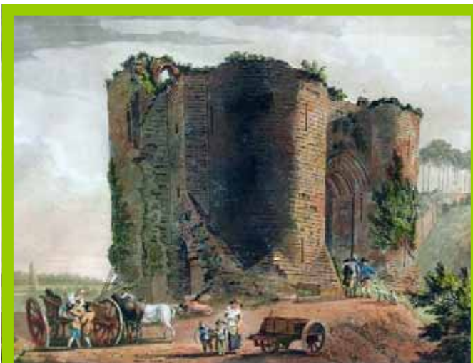
Tonbridge Castle, seized by Hugh Despenser in 1315, thinking it was part of the de Clare estates.

Already in 1315 he had seized Tonbridge Castle in Kent thinking it was one of the de Clare properties, only to discover that it actually belonged to the Archbishop of Canterbury, but not daunted he then went on to rob his sisters-in-laws, Margaret and Elizabeth, of their lands.