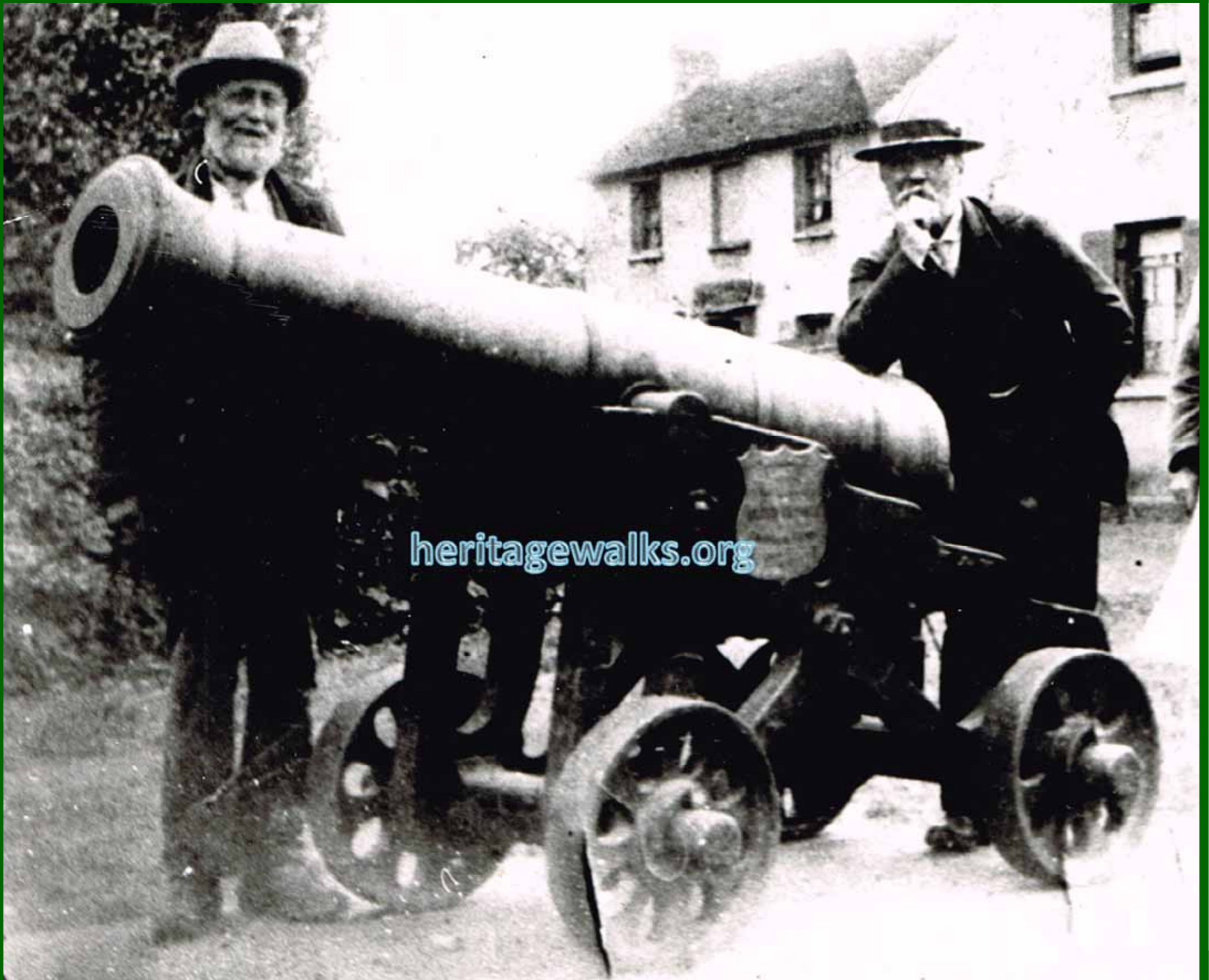
The original cannon in Chobham

In 1853 Queen Victoria inspected 16,000 troops on Chobham Common before they went off to fight in the Crimean War. In 1901 the War Office presented a cannon to the village to commemorate the event (and presumably those troops that didn't make it back).