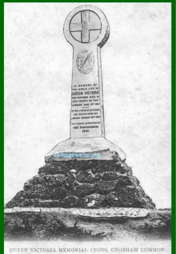
Left: Queen Victoria reviewing the troops in 1853.

For just over forty years the old 24 pounder stood on the green outside what became known as Cannon Cottage, but in 1942 to help the latest war effort the old gun was sent off to be melted down to make another weapon. The current cannon on the site dates from 1788 and was found laying in the Thames before being cleaned up and erected on its replica gun carriage in 1979.