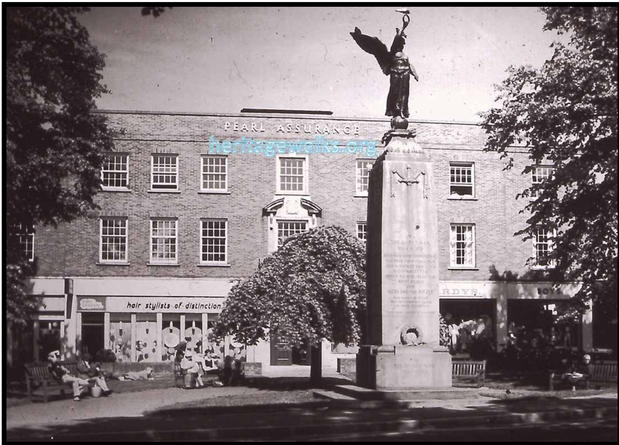
Above: Woking's War Memorial (now in Jubilee Square) lists the names of local men who fought for 'King & Country' during both the First & Second World Wars, but what about memorials to other conflicts?

One hundred years ago next week, Britain declared war on Germany. This was to be the 'Great War', the 'War to end all Wars', but it turned out instead to be the 'First World War' and sadly not the last of anything (other than a huge number of lives).