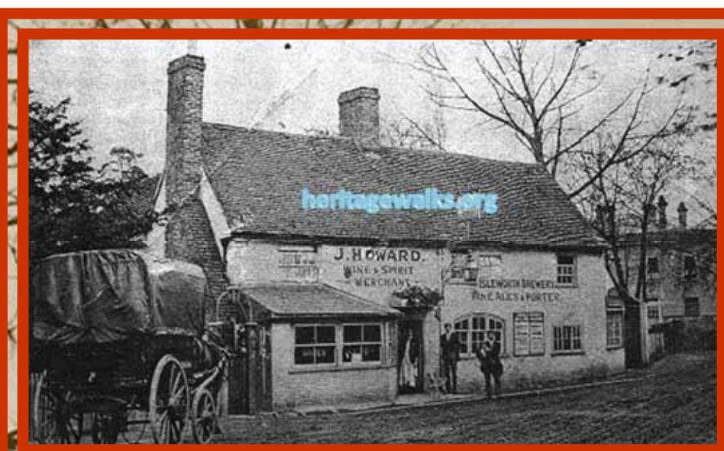
The original Blue Anchor at Byfleet (left) dated back to the 17 th century and in the 1780's was a beerhouse known as Hollydays. It was replaced by the present building (below) in the 1920's.

All have a history to tell however, which is why some of us can normally be found doing 'research' in the bar after my Sunday Heritage Walks.