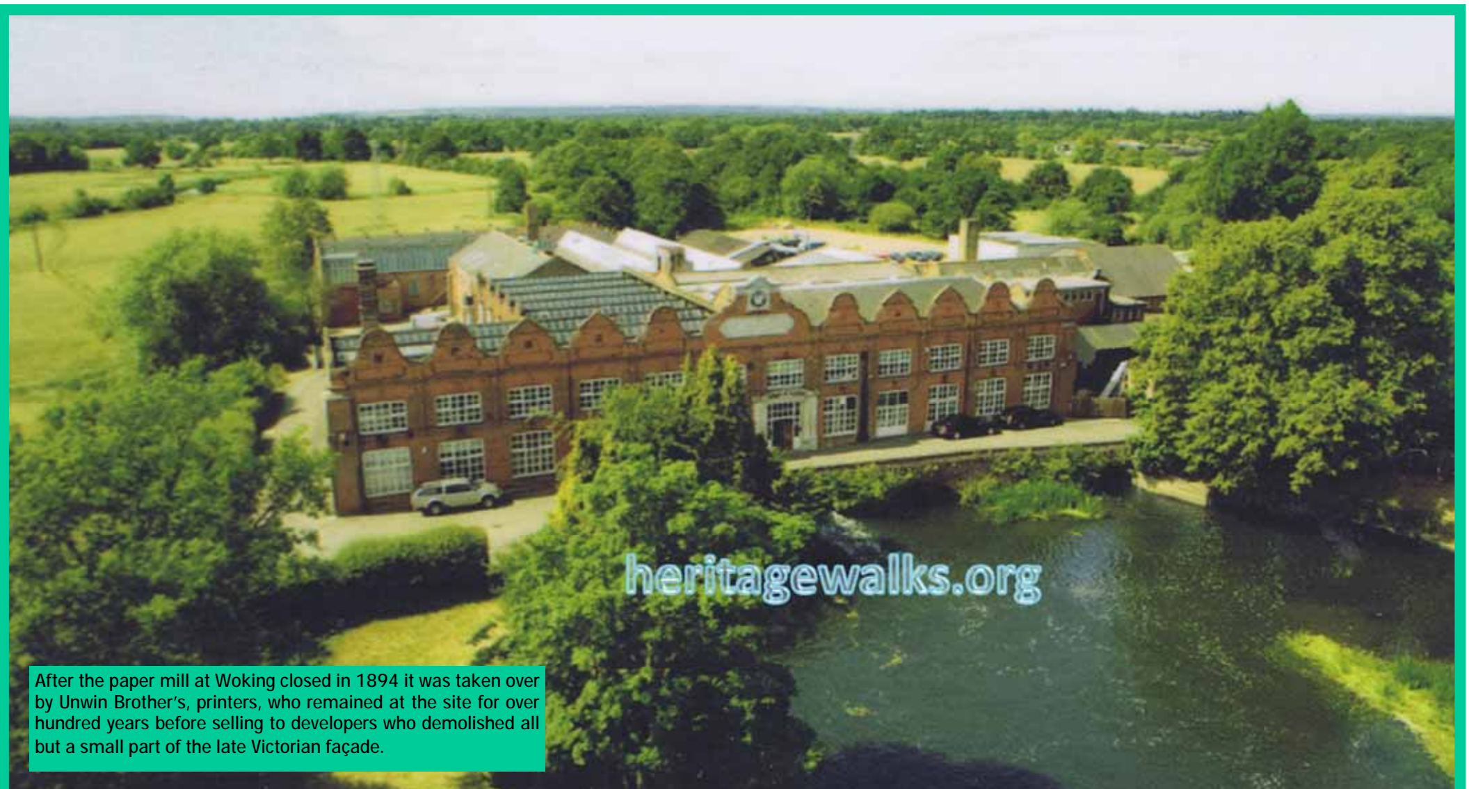
After the paper mill at Woking closed in 1894 it was taken over by Unwin Brothers, printers, who remained at the site for over hundred years before selling to developers who demolished all but a small part of the late Victorian façade.

following year to a new venture called the Woking Paper Company who just about managed to struggle on to 1894 when production ceased and the site was put up for sale.