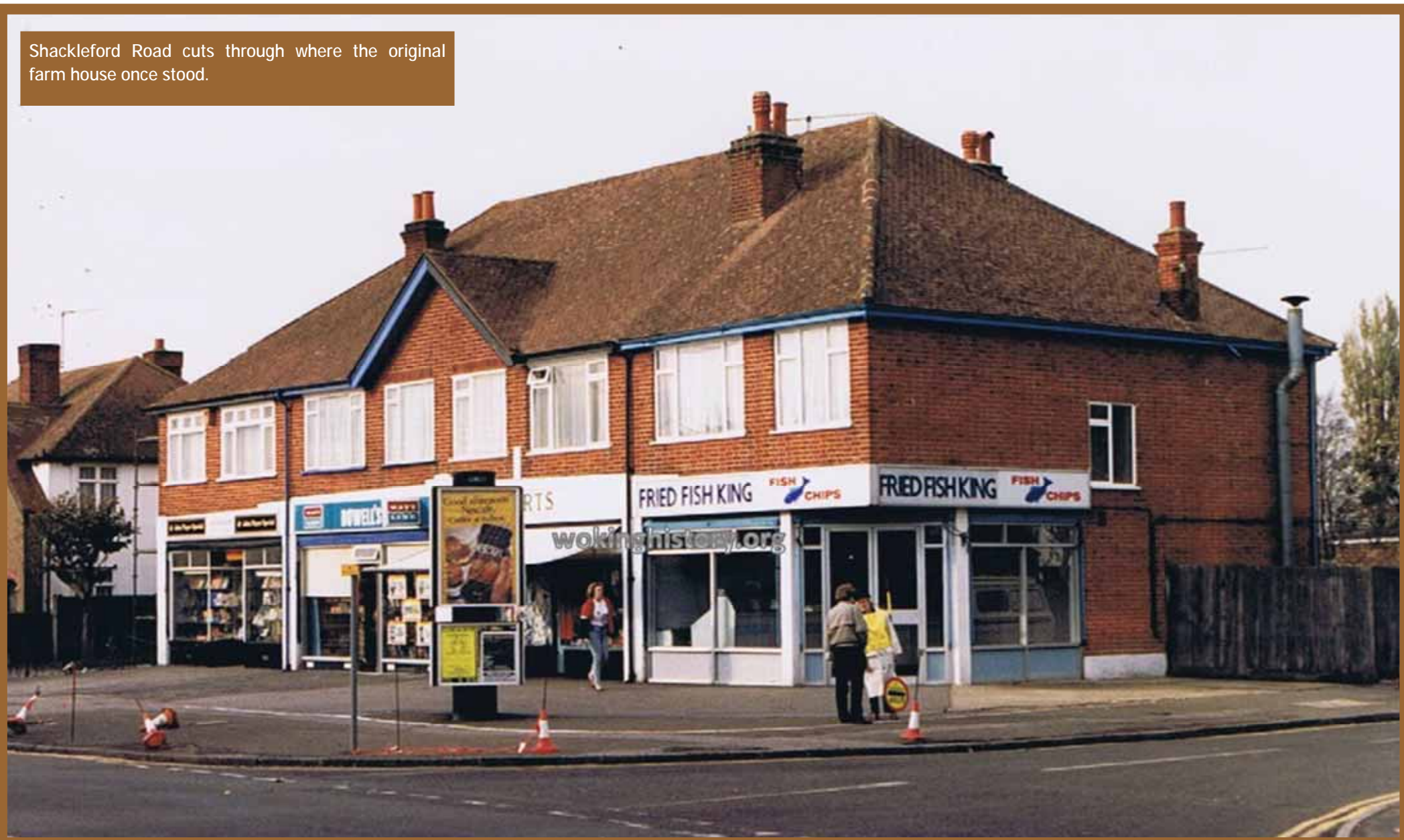
Shackelford Road cuts through where the original farm house once stood.

Council agreed to the naming of all three roads in October 1937, when the council also agreed to spending over £3,000 on surface water drainage of the estate, 'in advance of the by-pass being built'.