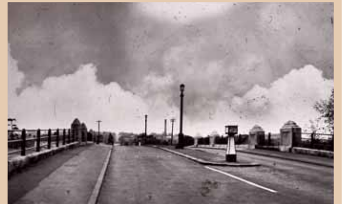
The original bridge (top) with the temporary footbridge (below) and the eventual replacement (above right).

bridges had been replaced by the mid 1920's but for some reason the old Monument Bridge remained and so the decision was made to demolish it and put up at least a temporary wooden bridge so that pedestrians could still cross at that point. It was not until January 1940 that the Engineer and Surveyor of Woking Council could report that the work was complete at a cost of £12,780 (the Ministry of Transport paying 50% of the bill).