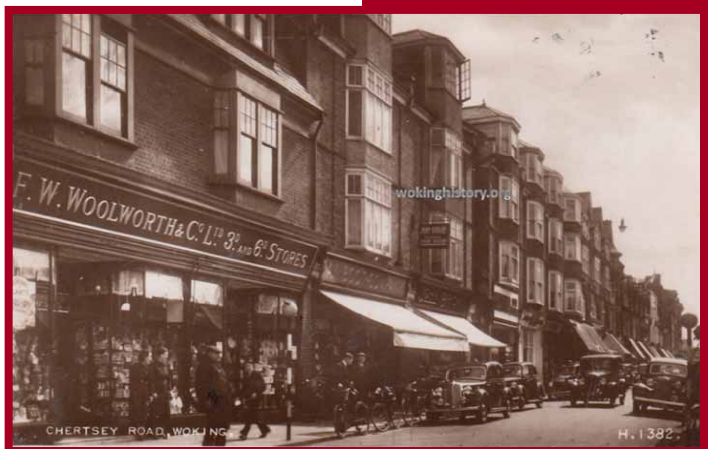
A number of local people recall a bomb falling in Chertsey Road, Woking, demolishing John Bright's shop, a couple of door up the road from Woolworth's.

Almost to the end, Woking was still very much at war.