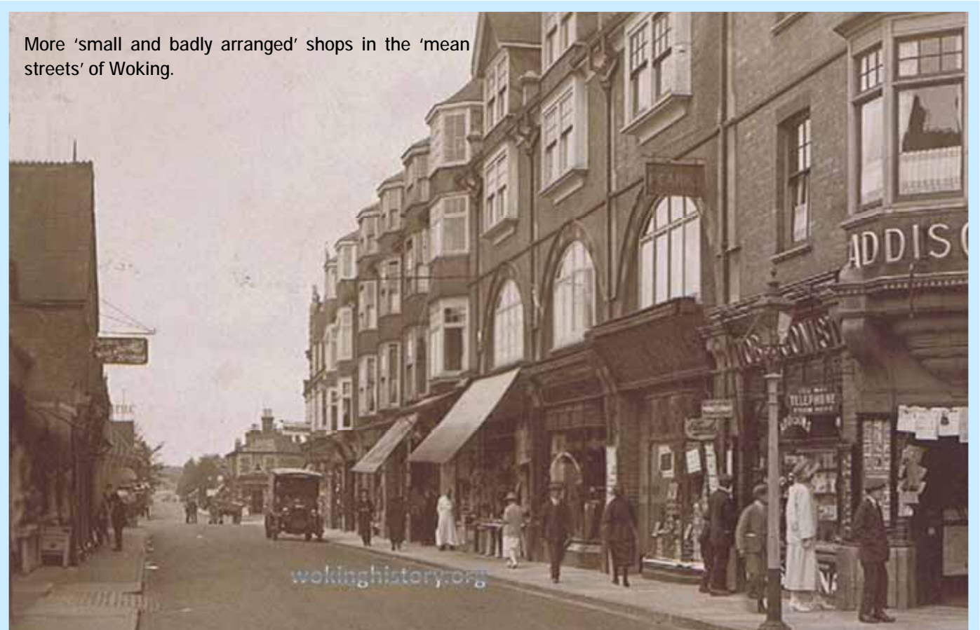
More 'small and badly arranged' shops in the 'mean streets' of Woking.

the authors cannot help but note that the shops in the town centre are 'mostly small and badly arranged in mean streets'.