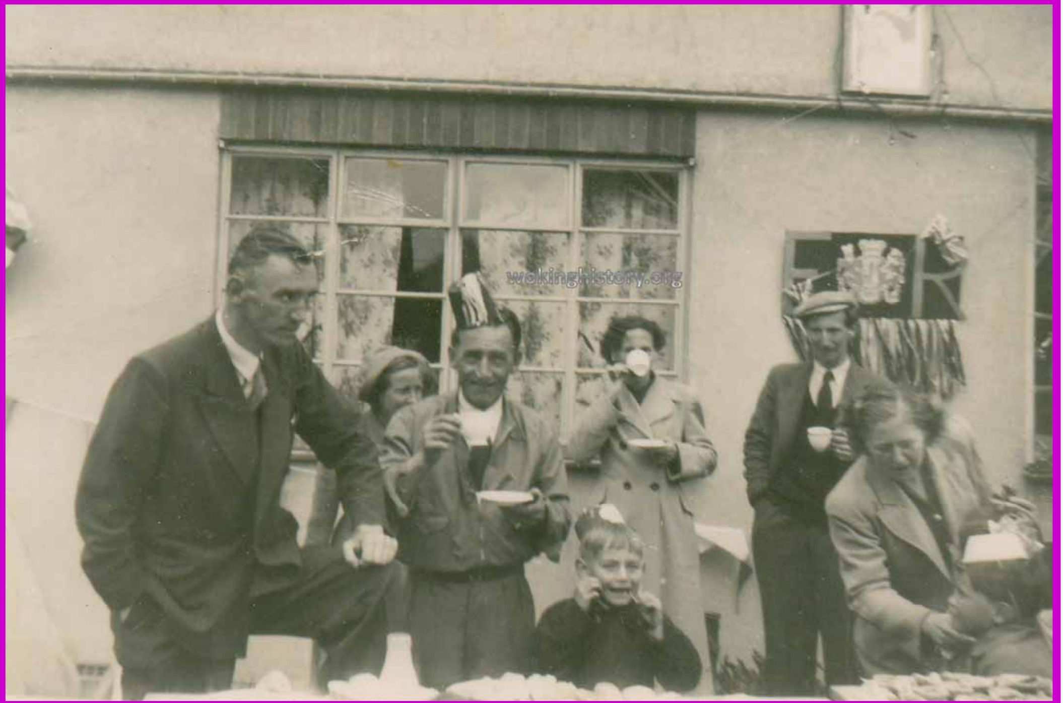
Residents in Knaphill enjoying their Coronation Tea.

The Rose Cottage Laundry appears to have been the setting for the Horsell Moor party, with entertainment after the tea provided by members of staff.