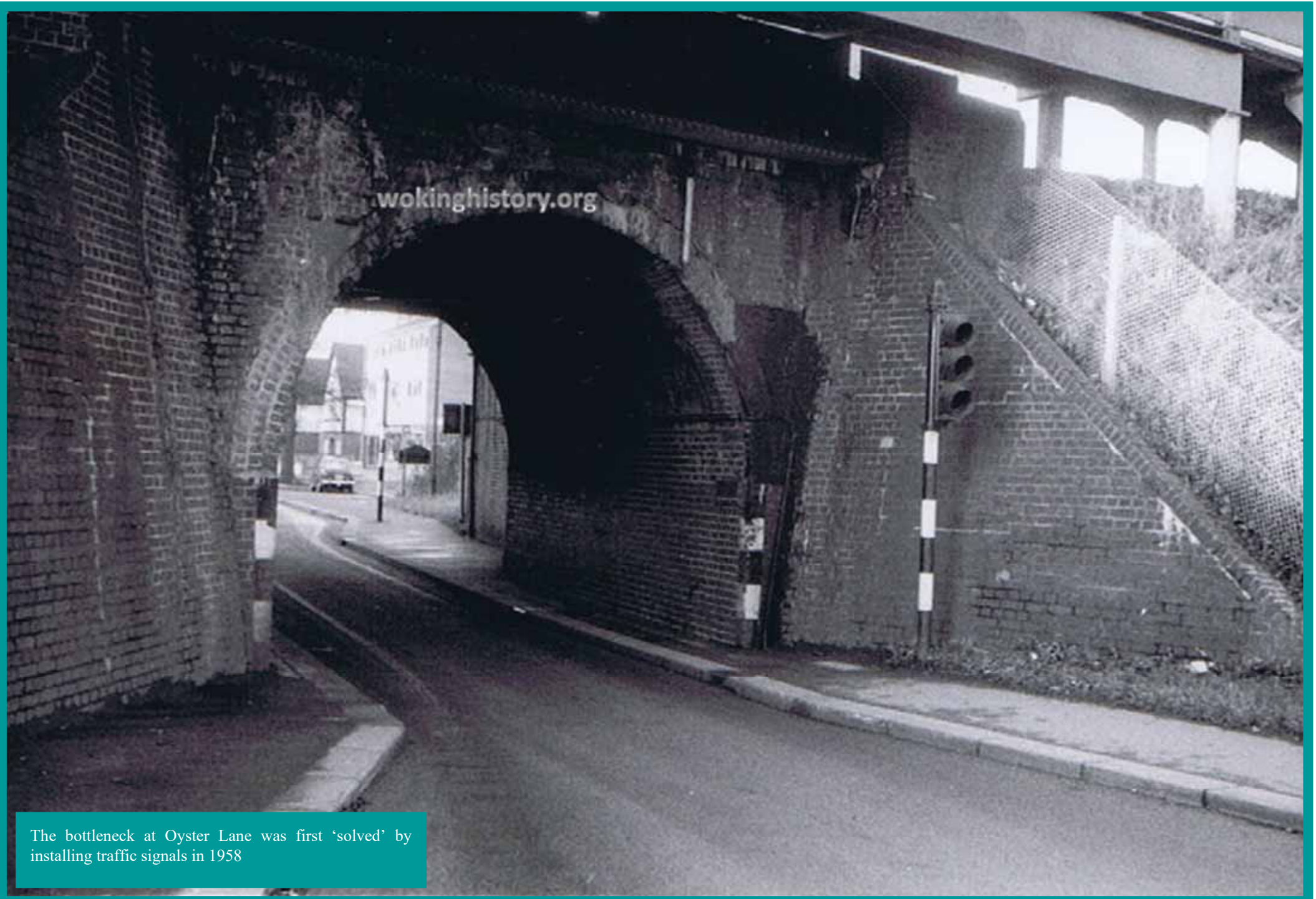
The bottleneck at Oyster Lane was first 'solved' by installing traffic signals in 1958

obviously progressed at some speed (current contractors on local road works please note), so that the new bridge was in use months before its official opening on the 10 th October 1958.