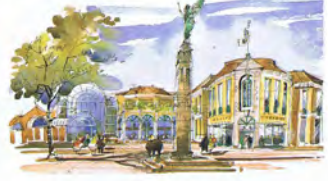
Artist's Impression of Town Square

The Peacocks will provide the people of Woking with the best shopping and leisure amenities in the region, as well as a new library and offices for use by local voluntary organisations.