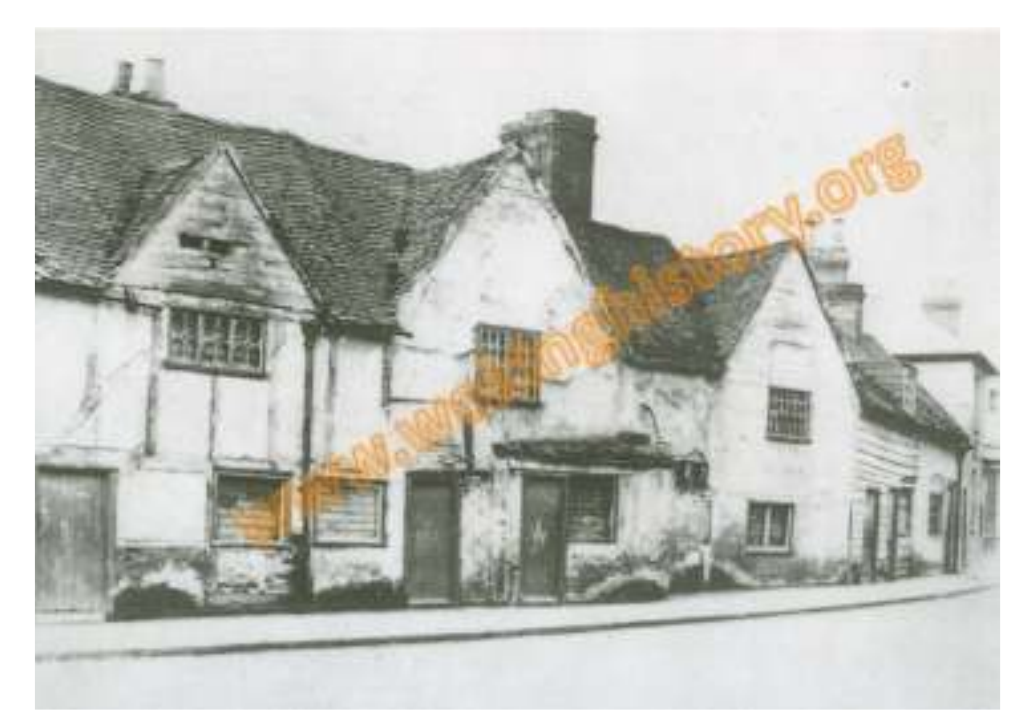
The corner of the High Street and Church Street, showing Clamps Cottages (above) before demolition, and their replacement by Butts Cottages (below).

Then, in 2020 (for reasons we need not go into here), I stopped doing my walks, talks and displays, and found I had the time to properly put together the history of my little corner of Old Woking.