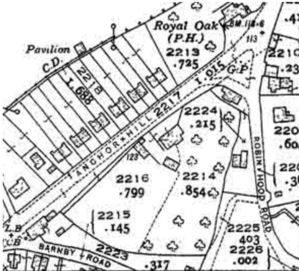
The 1935 Ordnance Survey 25' Map, shows the White House with its substantial grounds on the south side of Anchor Hill, between Barnaby Road and Robin Hood Road.