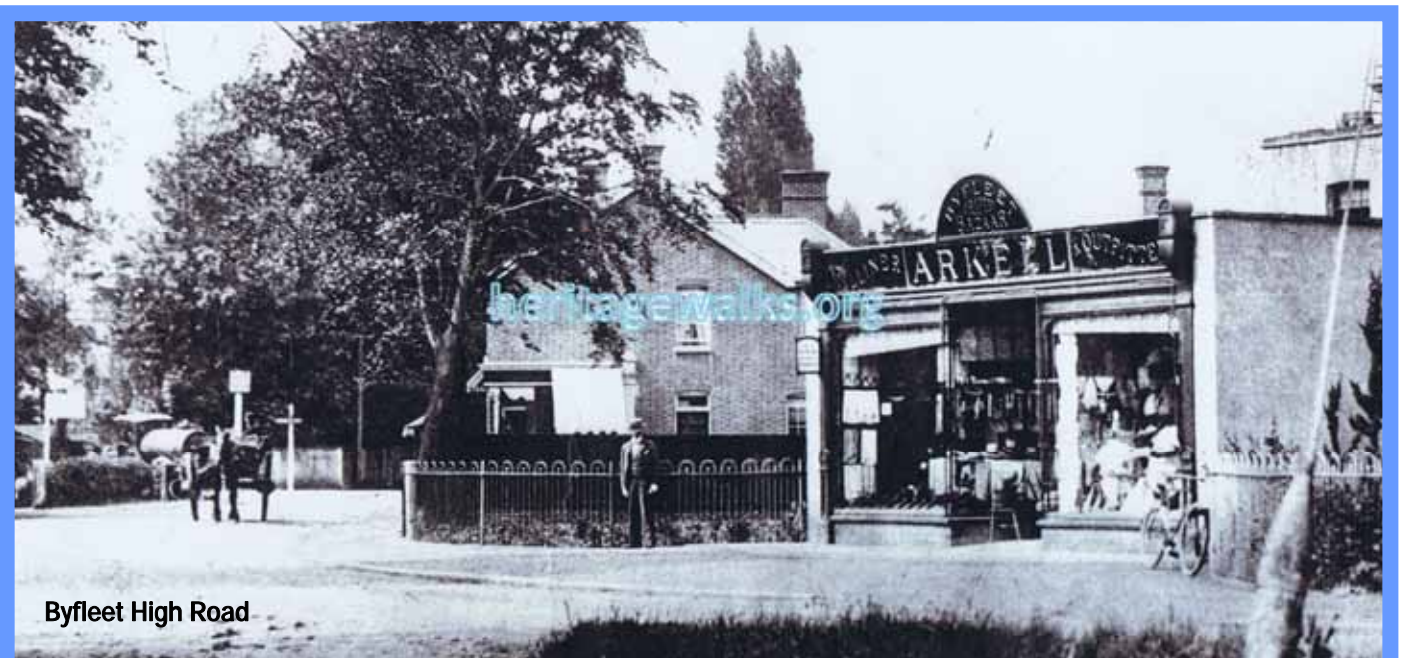
Byfleet High Road