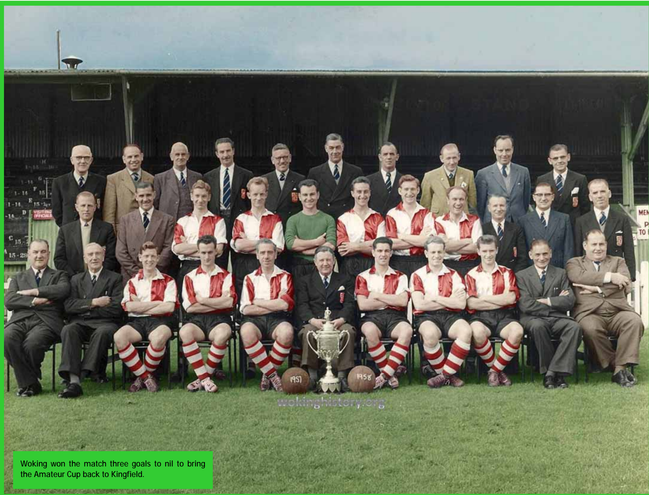
Woking won the match three goals to nil to bring the Amateur Cup back to Kingfield.

The key to Woking's success appears to have been its attack. In the 1956-57 season the front four had scored a record number of goals (104) – a point that was noted in the Wembley programme. It also noted that 'much of