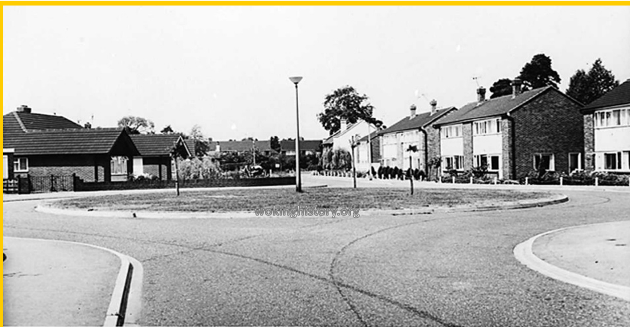
BKD.43. Heath Drive Estate . Brookwood.

not all applications for new housing were approved by the council, as Classic Homes Ltd found out when they asked to build eighty-eight houses on eleven acres of land at Shrubbs Copse on Sheets Heath (although they did get permission to build Riverside Close to the rear of what was then the Methodist Church in Connaught Road).