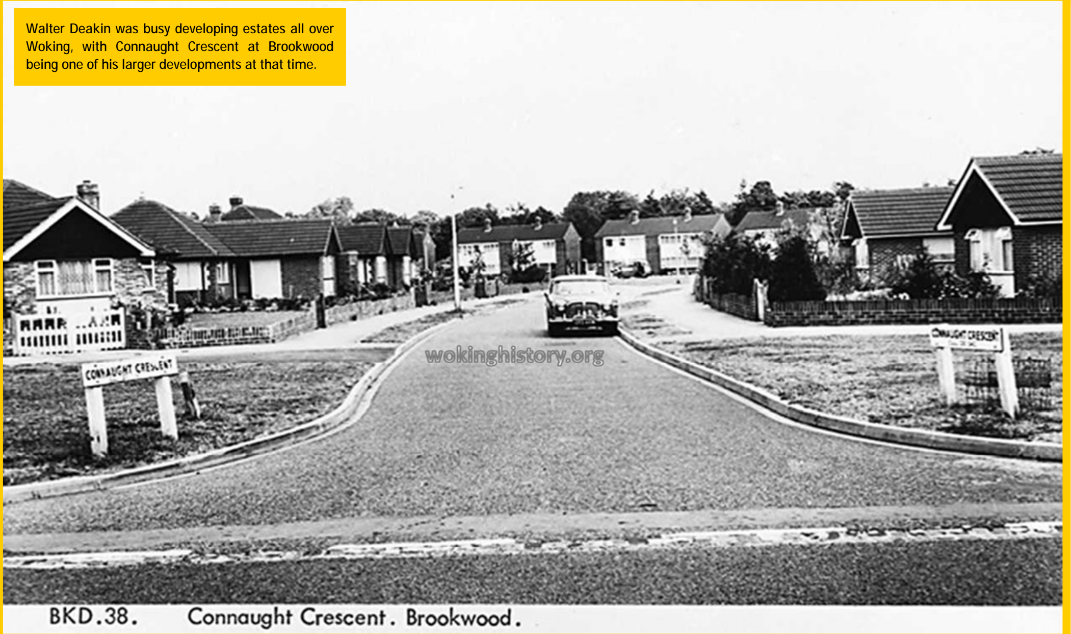
BKD.38. Connaught Crescent. Brookwood.