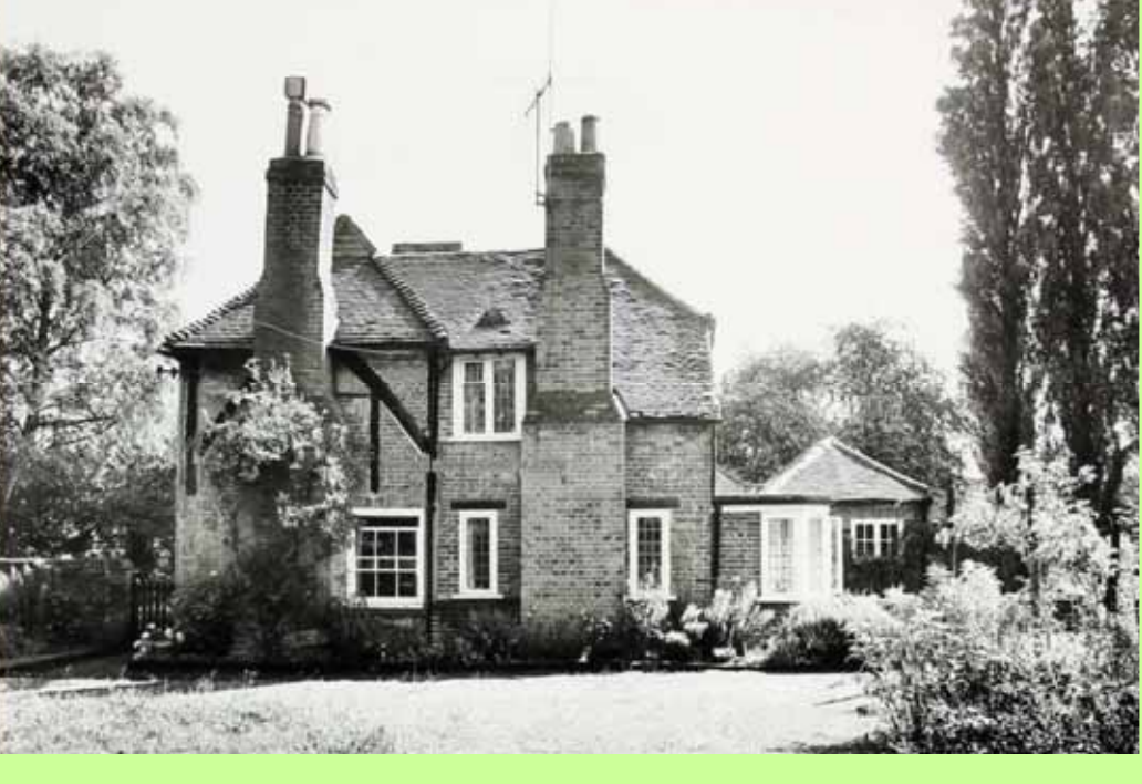
Vanners Farm was likewise demolished in the early 1960's as the old houses of the village became fewer still.