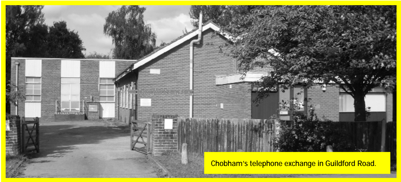
Chobham's telephone exchange in Guildford Road.

Incidentally, before STD, there had been many problems with people trying to contact numbers in both Cobham and Chobham, with some operators not realising that the two nearby exchanges were not the same. To combat this problem it had been proposed to rename the Chobham Exchange (when the new building was opened in the Guildford Road in the early 1960's) Chobham Common, but that was evidently abandoned, possibly at the suggestion that there was little 'common' about anyone in the village, let alone telephone users! In the end Standard Trunk Dialling overcame the issue, and both the Cobham and Chobham exchanges could be left in peace.