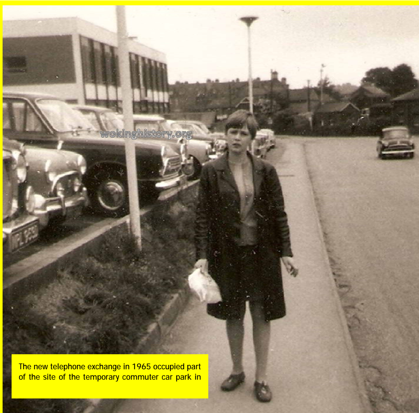
The new telephone exchange in 1965 occupied part of the site of the temporary commuter car park in

From then on your telephone allegedly developed a 'new personality' and calls to many places throughout the country were suddenly cheaper – if you managed to understand how to dial the new numbers correctly and the system didn't develop a 'hitch' (which it was often prone to do).