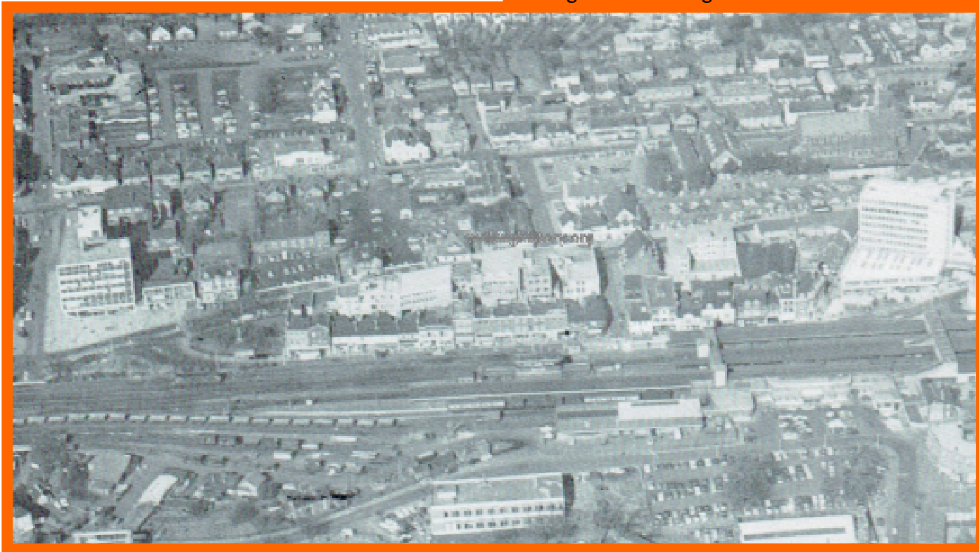
Woking before work began on the new town centre.

They were right, of course, on almost all counts – it is just a shame that it took Woking Council over twenty years to agree and in the 1990's finally build his four-floor covered arcade of shops.