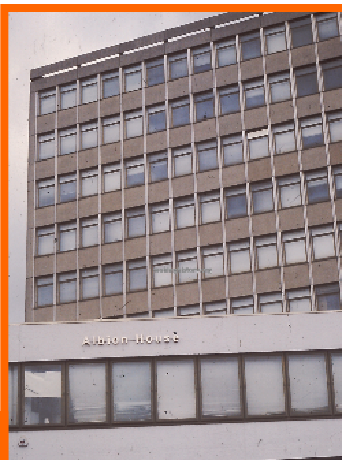
The eight storey Albion House (now Woking One) – the tallest building in Woking town centre at the time.

Woking in the mid-1960's - a town centre no longer fit for purpose.