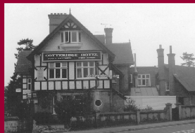
The Cotteridge, on the corner of Constitution Hill and Guildford Road, has long gone

Constitution Hill and Guildford Road, and the newly expanded Wheatsheaf Hotel at Horsell were not exactly known for their caviar and smoked salmon.