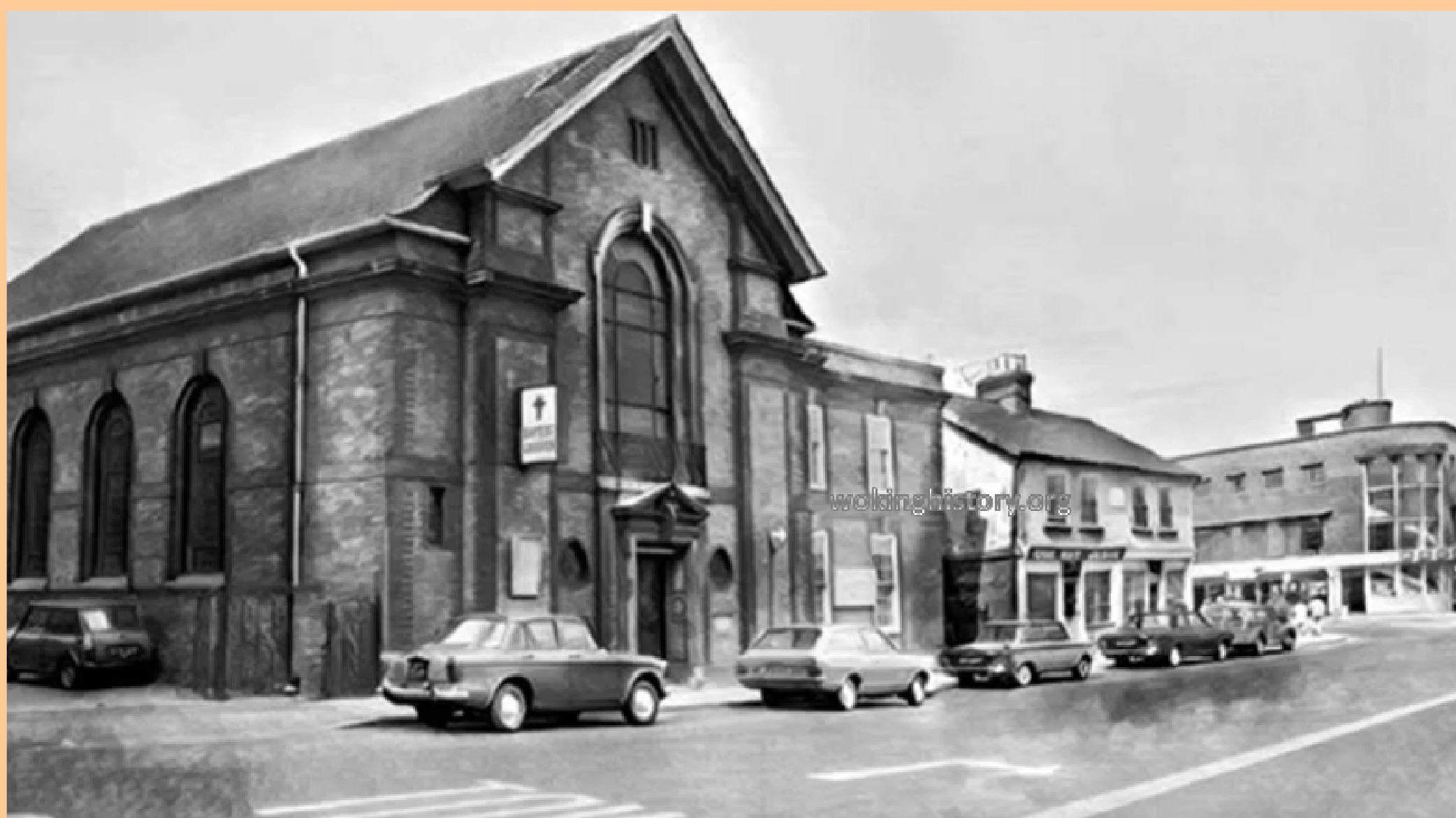
Percy Street (which would eventually become part of the town's by-pass and renamed Victoria Way), only allowed traffic to head north to Co-op corner.

Chobham Road and then Chertsey Road (and so back to the station); go straight on and turn into Chertsey Road (or Duke Street) to once more enter the affray; or turn left to a new set of traffic lights at the junction with Church Street.