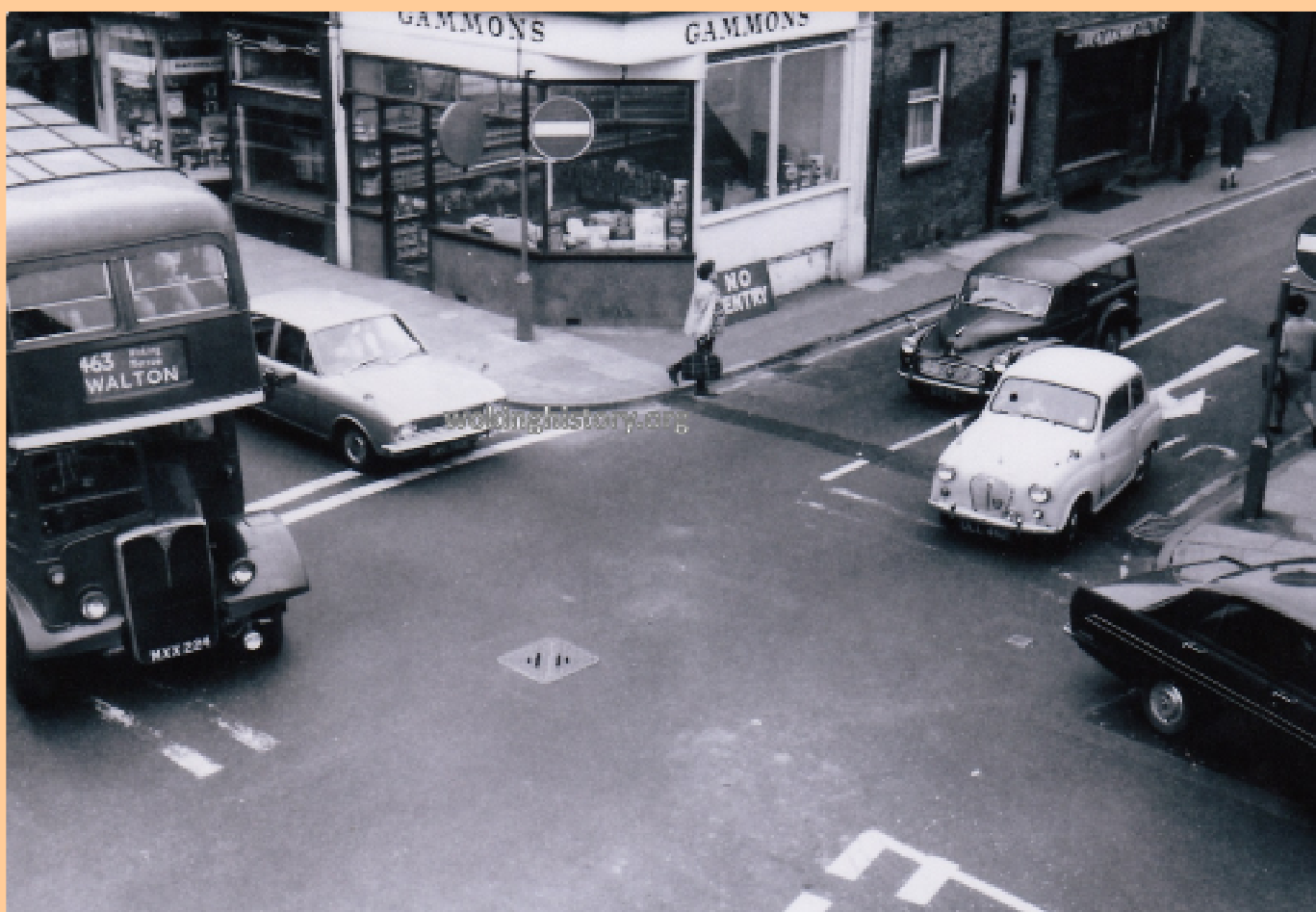
The worst section was Chobham Road between Commercial Road and Church Street, where buses had to turn left and then right within a relatively short length of road.

In the end the 'experiment' was 'tweaked' and the poor motorist had to get used to a new set of one-ways and regulations. Indeed, you could say that the tweaking is still going on in our modern-day merry-go-round that is Woking Town Centre's 'temporary' road system.