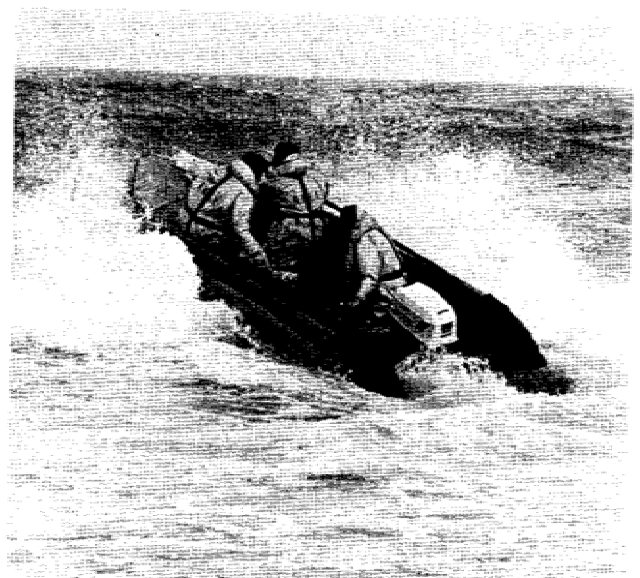
A typical craft belonging to the Royal National Lifeboat Institution (RNLI) to which so many Yachtsmen and other seafarers owe their lives.

This page kindly donated by AIRSCREW WEYROC LTD., WEYBRIDGE, SURREY