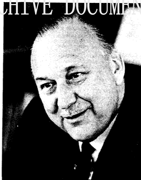
THE RT. HON. LORD ROBENS OF WOLDINGHAM, P.C., D.C.L., LL.D.

Lord Robens was until June 1971 the Chairman of the National Coal Board. He has had a long and distinguished career in politics, and as Minister of Labour, was a Member of the Cabinet in the Labour Government of 1951. He became a Privy Councillor on joining the Cabinet.