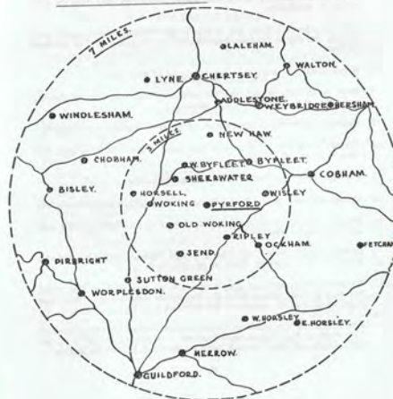
FLOWER SHOW RADIUS (See Rule 1, Page 13).

GENERAL RULES (continued from page 15) (c) The awarding of prizes shall be entirely at the Judges' discretion and in the event of a scant entry for any class or where the exhibits do not in the Judges' opinion warrant a prize, the Judges may decline to make an award. In any event if there are only three entries in any one class not more than two prizes shall be awarded and if there are less than three not more than one prize shall be awarded. 9. The Judge's decision as to relative merit shall be final. Any protest or objection which shall be only on the grounds of misinterpretation of the schedule, must be made in writing and lodged with the Secretary before 3 p.m. on the day of the Show and be accompanied by a fee of 10p, which will be refunded if the objection is upheld. 10. Dogs will not be admitted to the tents at any time on any consideration whatsoever. 11. This schedule shall be subject to alteration without notice if deemed necessary by the Committee. 12. The Committee shall have the power to make such further Rules for the successful running of the Show as it may find to be expedient. 13. The Committee's decision on all points arising from the Rules shall be final. 14. The Committee do not accept responsibility for any accident sustained by any exhibitor or spectator or other person before, during or after the Show nor for any damage to or loss of property.